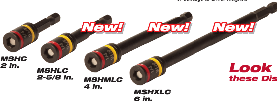
MSHC 2 in.

OPTIMUM HEAD HEIGHT Zip-in® and Bit-Tip® screws feature an optimum head height that securely engages without risk of damage to driver magnet.