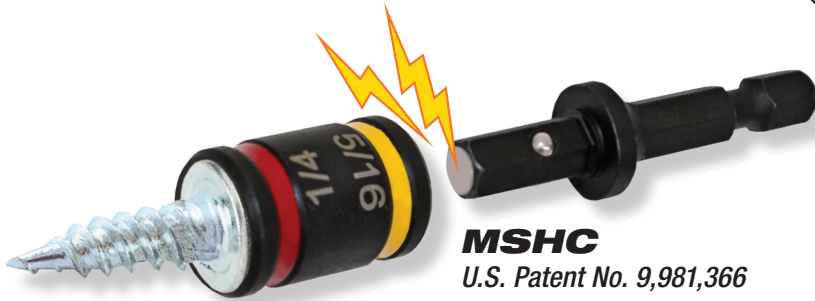
MSHC U.S. Patent No. 9,981,366